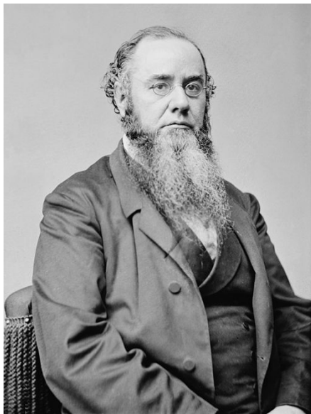
Secretary of War, Edwin M. Stanton

I make this particular statement as a ground for my application, although my services in the field would, I think, entitle me to consideration. 6