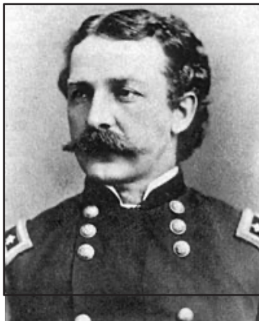
Lieutenant General Nelson Miles

By the time Lieutenant General Nelson Miles retired in 1903, his 42-year record of military accomplishments was staggering. From the Civil War, through the Indian War period, and then the Spanish American War, his soldier and leadership skills were exemplary. In addition, with respect to the history of the nation's highest award, the Medal of Honor, his involvement is likely without parallel. That involvement made him an obvious candidate to chair the Congressionally mandated 1916 Medal of Honor Review Board and, most importantly, to understand the consequences of the actions required under the statute that created the Review Board.