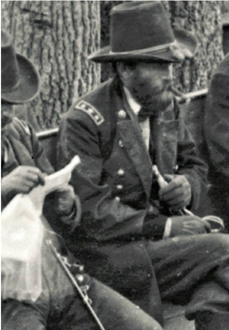
General Grant at Spotsylvania Courthouse